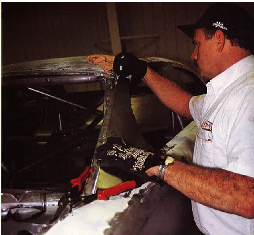
This fabricator is fitting the A-pillar on a Taurus downforce car. Note the width of the A-pillar base and flatness of the front fenders. Below: This is a normal truck arm setup: The truck arm is an I-beam using a spherical bearing to attach to the frame. It mounts solidly to rear with U-bolts.

Caster — the angle of a spindle frontward or rearward. Caster stagger is the difference between the static caster settings; it affects the amount of pull to the right or left a driver experiences. The more caster stagger, the more the vehicle pulls or steers.